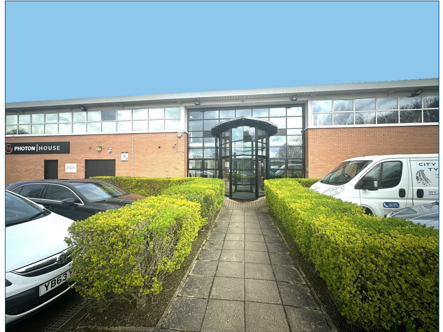
Photon House, Percy Street, Armley, LS12 1EL £370 (From) Per Month